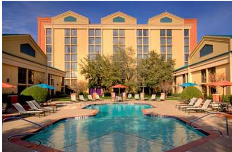
The 282-room DoubleTree by Hilton DFW Airport North is one of four hotels that Richfield Hospitality assumed management of with its latest contract.

PHOENIX—In their ongoing quest to fuel rapid expansion for Richfield Hospitality, executives are using multiple platforms to add hotels to the Denver-based company's portfolio.