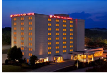
The 193-room Crowne Plaza Pittsburgh Airport will be rebranded as a Sheraton hotel.

The properties will undergo differing renovation and repositioning programs for a combined total of approximately US$12 million in additional investment. The DoubleTree by Hilton Dallas-DFW Airport North hotel was recently rebranded, and the Crowne Plaza Pittsburgh Airport Hotel will convert to Starwood Hotels & Resorts Worldwide's Sheraton brand.